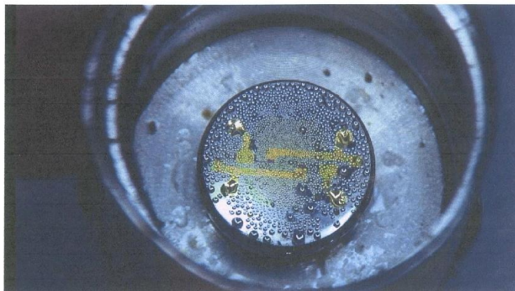
Picture3: moisture on the cell/membrane

Tel: +44(0)1277 226666 Fax: +44(0)1277 226611 Fax: +44(0)1277 226640 (Parts) Email: sales@mountune.com www.mountune.com